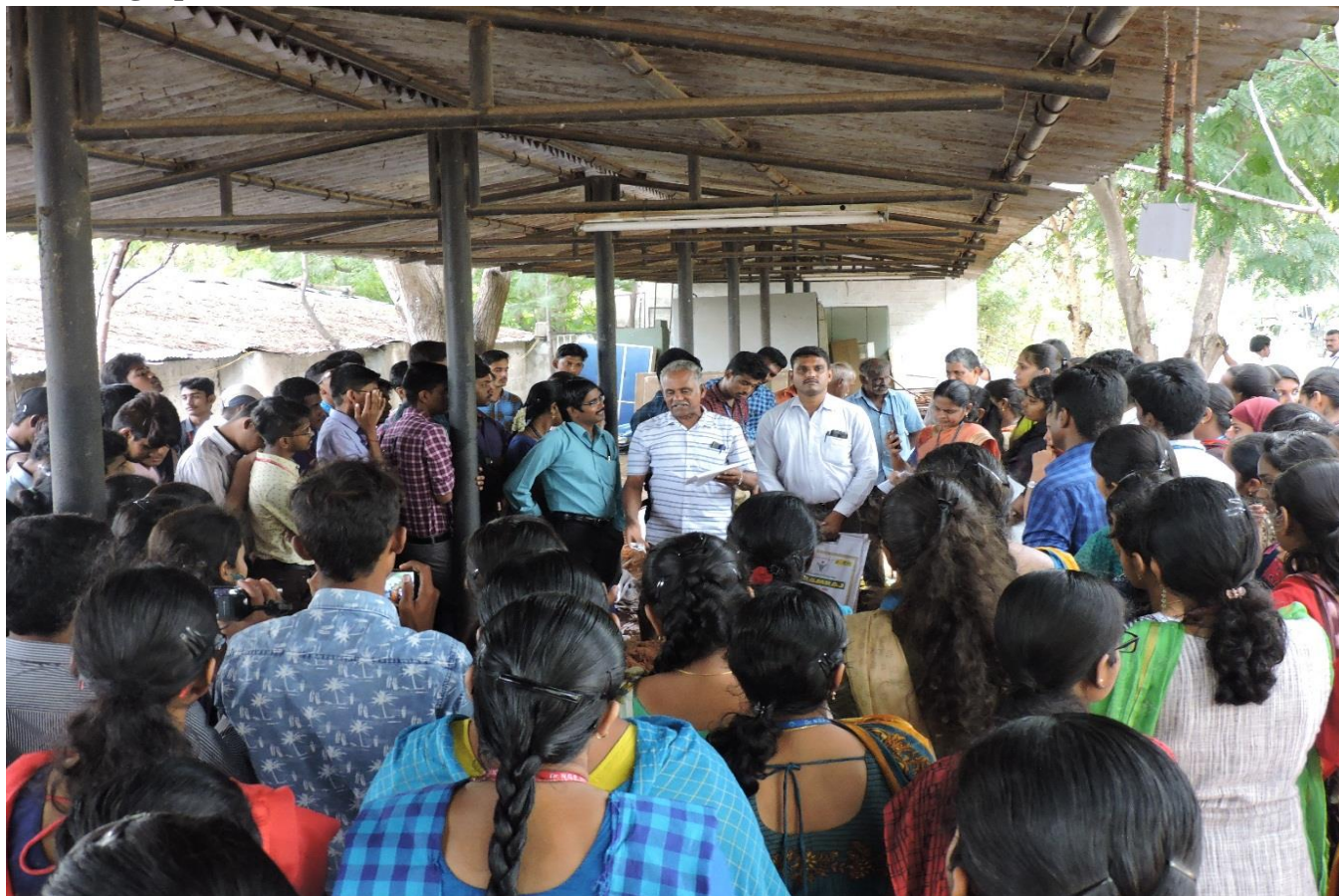
Health is Wealth - Sanitation and Cleanliness event conducted on 12.2.2019 at Veeriyampalayam, Karupparayampalayam, Kaikolampalayam