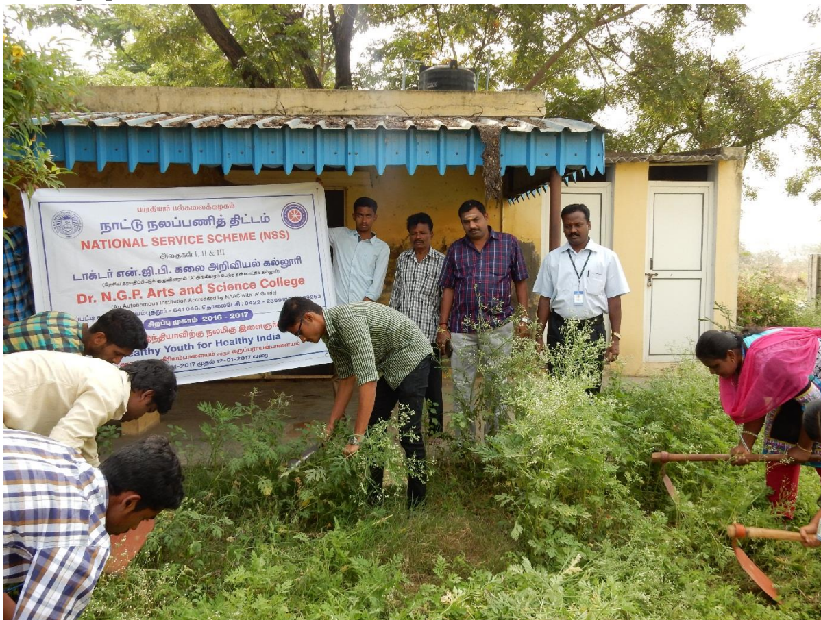
School and Temple Campus Cleaning - SWACHH BHARAT event conducted on 8.2.2019 at Veeriyampalayam, Karupparayampalayam, Kaikolampalayam