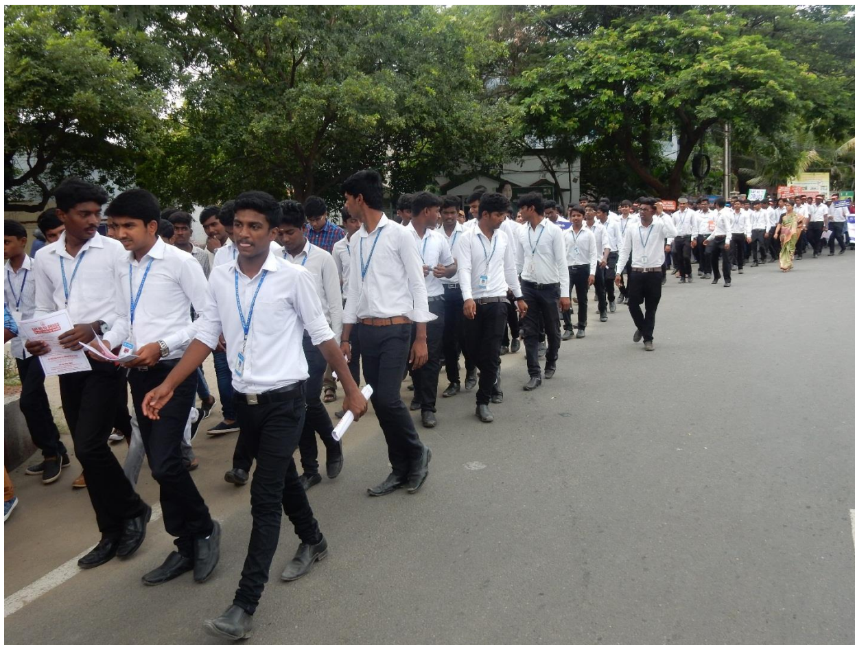
Environment Awareness Rally event conducted on 7.2.2019 at Veeriyampalayam, Karupparayampalayam, Kaikolampalayam