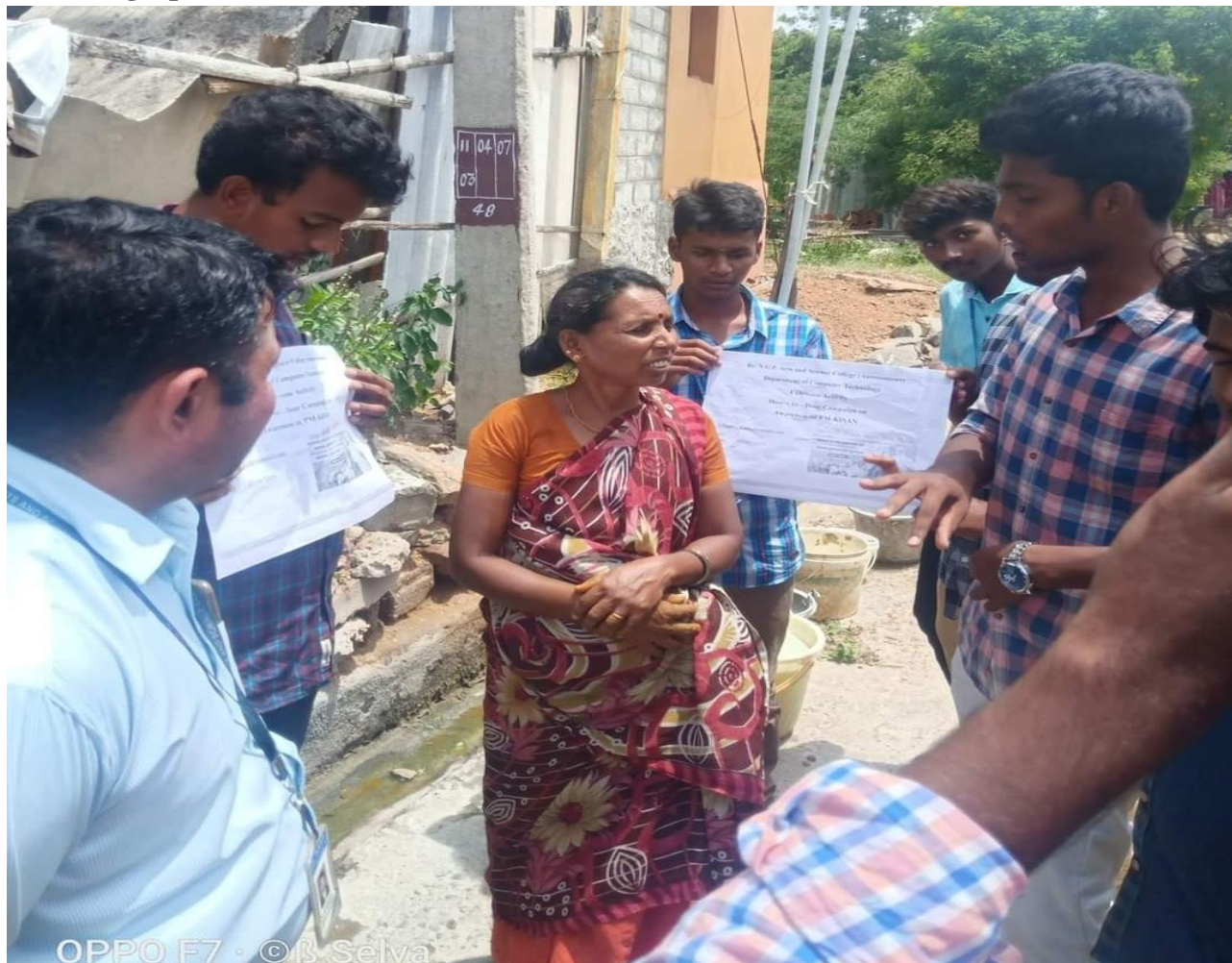
Plastic Eradication and Solid Waste Management event conducted on 9.2.2019 at Veeriyampalayam, Karupparayampalayam, Kaikolampalayam