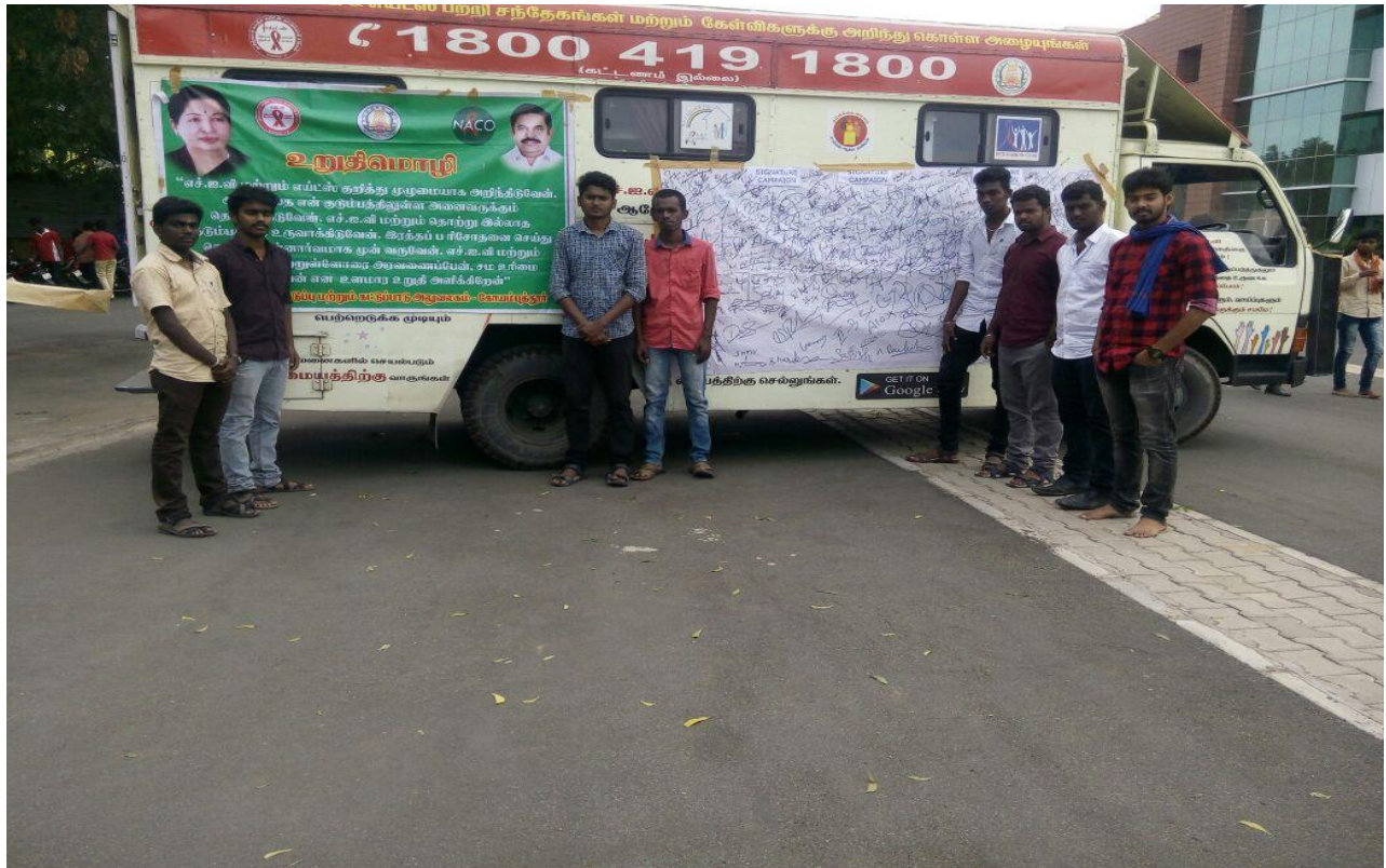
AIDS and DENGUE Awareness Programmeevent on 10.02.2019. The event has been conducted at Veeriyampalayam, Karupparayampalayam, Kaikolampalayam